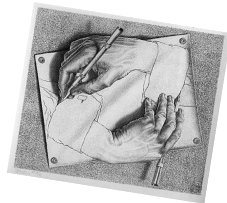
'Drawing Hands' by Dutch artist M.C. Escher.