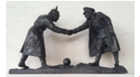
This bronze statue is on display at St Luke's Church in Liverpool as a tribute to the soldiers in 1914.

3. Five months into the first World War, troops took a Christmas Eve break from fighting to sing carols together across the battlefield. Dozens of German and British fighters greeted each other, shook hands, some even exchanging cigarettes as gifts. ' The Christmas Truce of 1914 ', as it became known was one of the last examples of wartime chivalry. In German it is called ' Weihnachtsfrieden ' and ' Trêve de Noël ' in French.