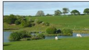
Temperate areas of the United Kingdom