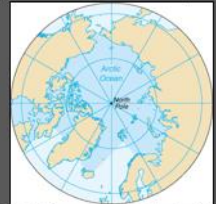
Arctic Ocean and the North Pole