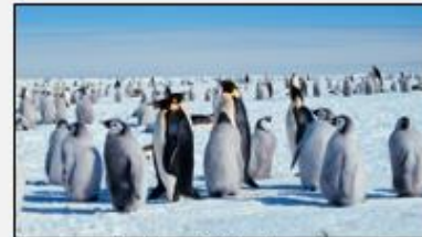
Antarctic ice sheets