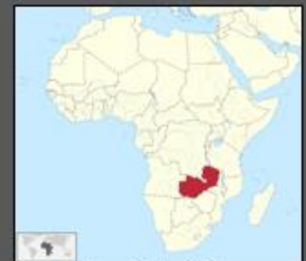
Zambia in Africa