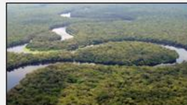
Tropical areas of Africa