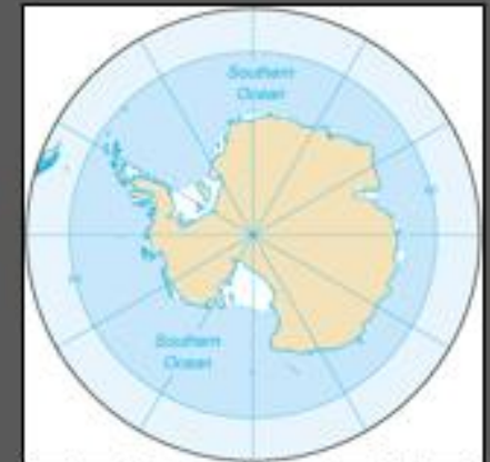
Antarctica and the South Pole