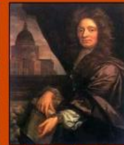
Sir Christopher Wren