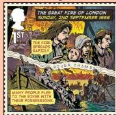
Modern graphic novels