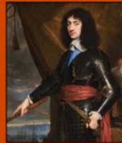
King Charles II